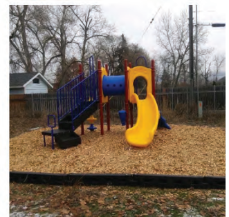
Playground at River Acres