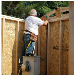
Hard at work at C & C