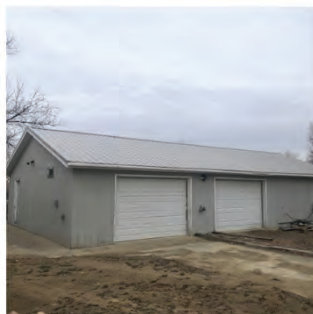
New roof on shop in Clear Creek