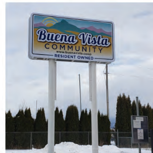
New sign at Buena Vista