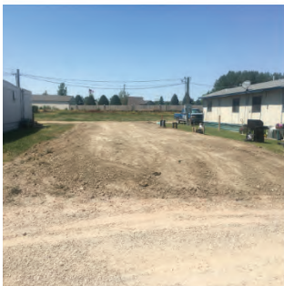
Lot work at Missouri Meadows

View Vista, Livingston - They are renovating their shop to serve as a community center. Supplies such as drywall, paint, printer, projector, books, tables and chairs were on the long list of items purchased. The community will be organizing a resident work-day to come together to make this vision a reality.