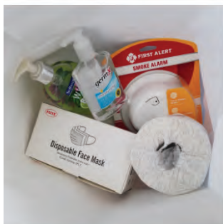
Gift bags made by C & C

Libby Creek, Libby - They were able to fully renovate their rental studio cabin that needed substantial renovations. The cabin has been completed and rented to help stabilize operations in the community. They received the Better Together Grant and installed a cover over their mailboxes and message board.