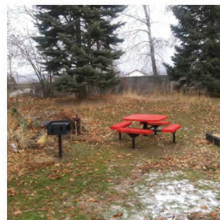
Picnic area at River Acres