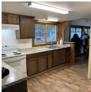
Community Center at Northwood