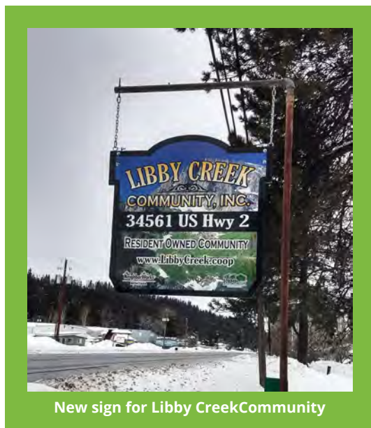
New sign for Libby Creek Community