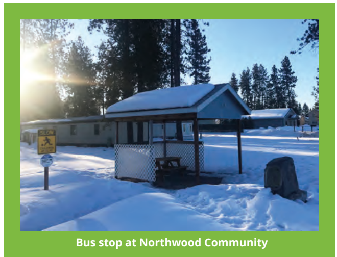
Bus stop at Northwood Community