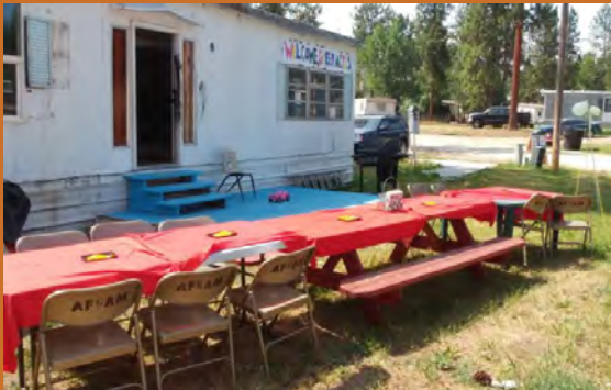
Reception set up at Northwood in Pablo