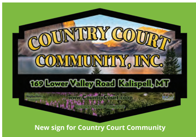
New sign for Country Court Community