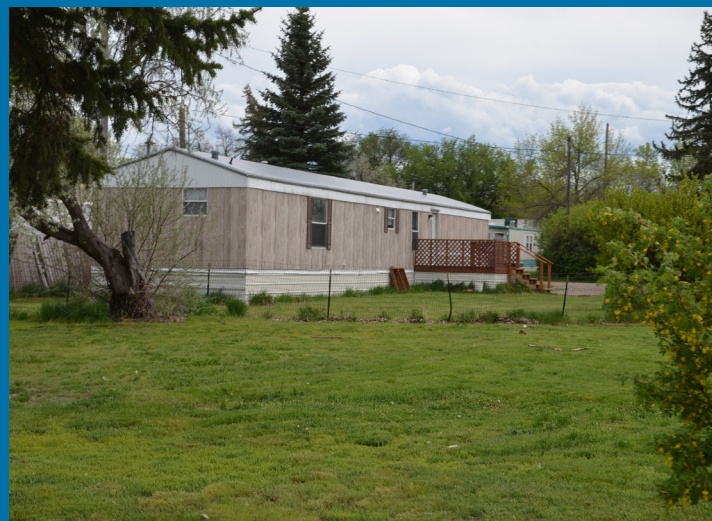
Trailer Terrace Community Center

All of us at NeighborWorks Montana are so proud of you Don, and the entire community of Trailer Terrace for your exceptional success at building a strong community. Keep up the good work!