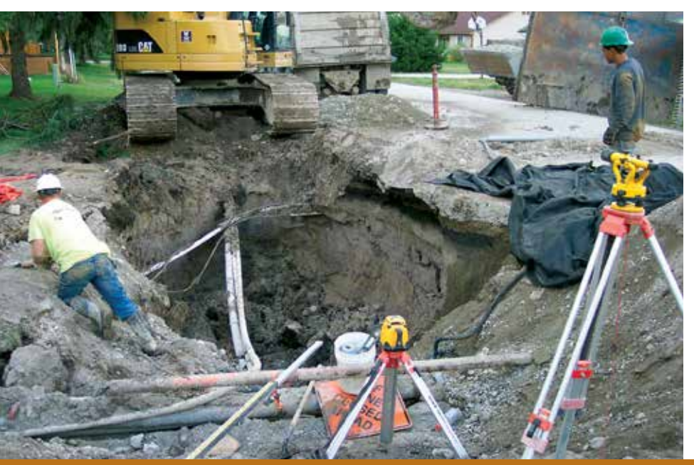
Securing Resources for Community Improvements

Of course, everyone wants "free" money — or grants — and you might have success securing some for your project. However, many projects are completed with loans and it is likely your project will be one of them. It may be tied to a refinancing of your community or as subordinate or junior financing to your existing loan.