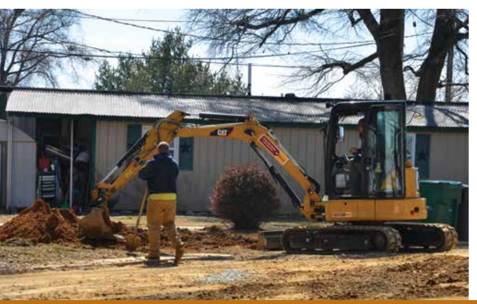
Securing Resources for Community Improvements

Second, your ROC also has three nonprofit organizations providing support services that are clear forms of stewardship. Those three organizations are: